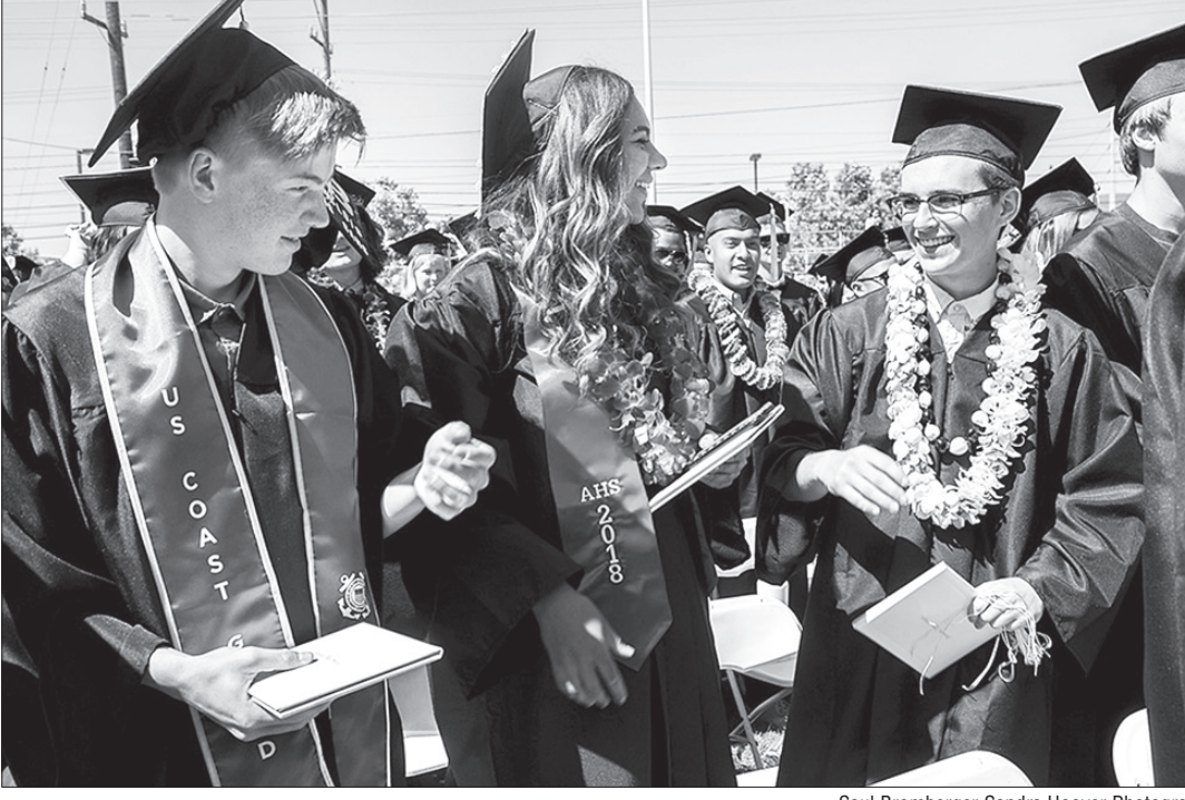
Graduates of Alameda High School celebrate just after receiving their diplomas at the ceremony held June 7.