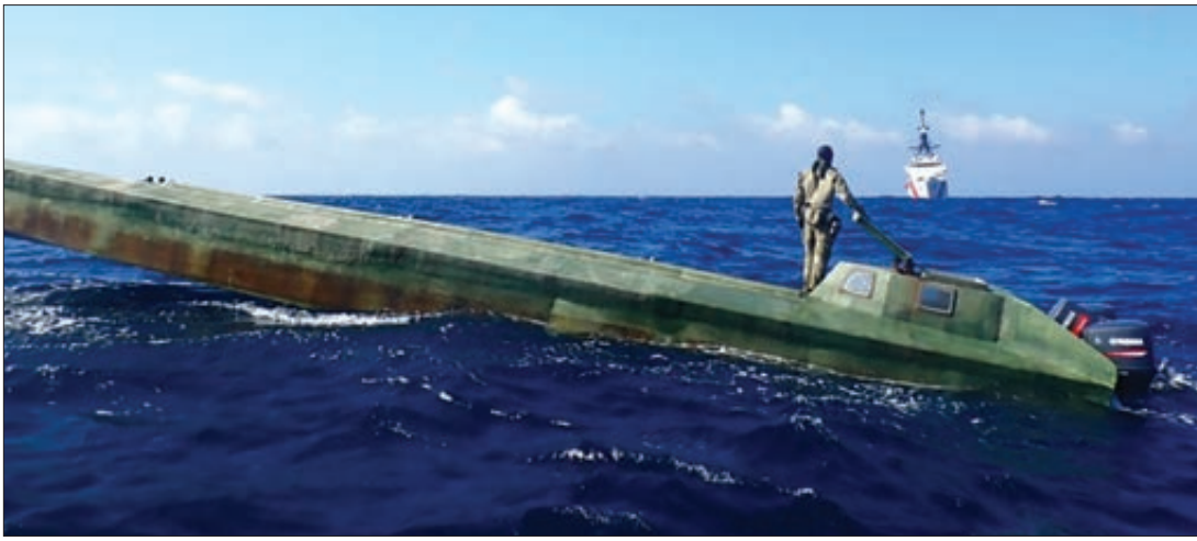
U.S. Coast Guard Cutter Bertholf

Contact Sun staff at editor@alamedasun.com.